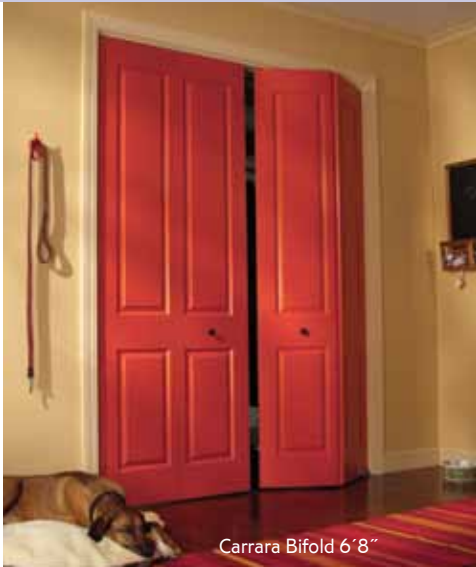
Carrara Bifold 6'8"

Austere yet welcoming, this uncluttered design has broad appeal.